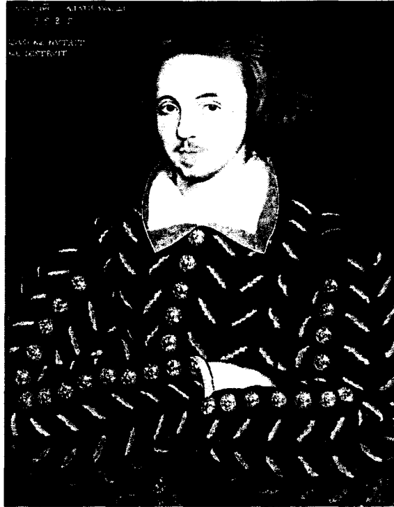
Our boy Kit. Or not.